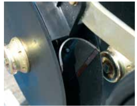
The disc coulters and scraper

The short and compact design of the coulters bar and linkages provides maximum stability.