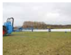
Mounted field sprayers