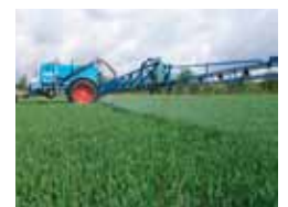
Trailed field sprayers

LEMKEN GmbH & Co. KG Weseler Straße 5 46519 Alpen Telefon +49 2802 81 0 Telefax +49 2802 81 220 lemken@lemken.com www.LEMKEN.com