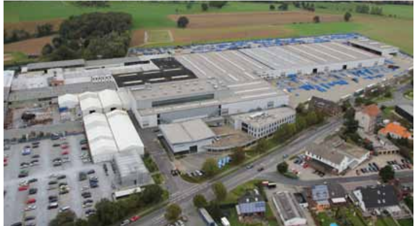
LEMKEN in Alpen/Germany

As professional crop production specialists, LEMKEN is one of the leading companies in Europe, with over 1,100 employees worldwide, achieving sales revenues of more than EUR 270 m. Originally founded in 1780 as a blacksmith's forge, the family company produces high-quality and high-performance farm machinery for soil cultivation, sowing and plant protection at its German headquarters in Alpen and at its two other production sites in Föhren and Meppen. 70 percent of the approximately 15,000 machines per year are exported.