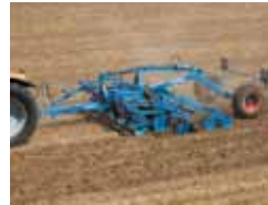
Compact disc harrows