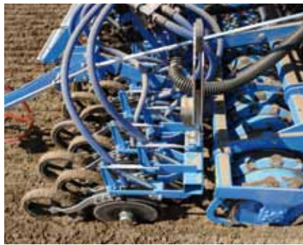
The double disc coulters

The double disc coulters with rubber depth control wheels places the seed accurately at a constant depth, even under changing soil conditions.